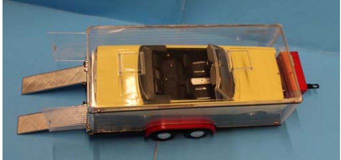
. Tony D'Anjou's 1/24<sup>th</sup> AMT ERTL "Super Trailer" Display case trailer