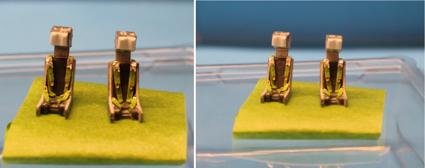
Edward Melle used tape belts, brass wire, and aluminum foil to detail the seats for his 1/72<sup>nd</sup> Eduard L-39C