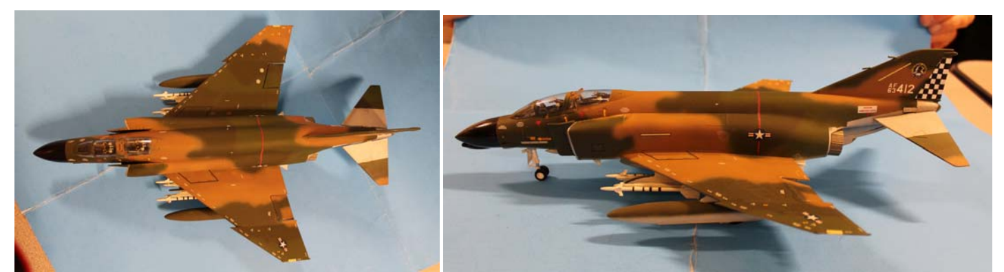
Rich Filteau's 1/48<sup>th</sup> Monogram F-4C Phantom II with 57<sup>th</sup> Fighter Squadron markings from Iceland in 1973